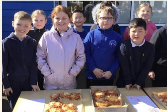
Children with their delicious pizzas

Children then sold the pizzas at breaktime to the whole school to raise money for The British Red Cross for their earthquake appeal, which children have been learning about throughout their Curriculum Enquiry of Natural disasters.