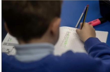
A child during a Year 5 class at a primary school in Yorkshire, PA. Picture date: Wednesday November 27, 2019.

New data has revealed the Nottinghamshire primary schools with the highest reading, writing and maths scores for 2022-23.