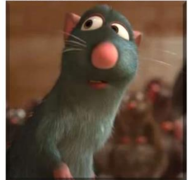
Pictured: Remy from the 2007 film 'Ratatouille'