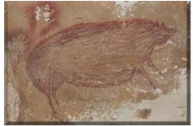
Pictured: The Sulawesi warty pig on the wall of the cave in Indonesia

A cave painting of a wild pig that is thought to have been crafted over 45,000 years ago has been discovered by archaeologists in Sulawesi, Indonesia. The warty pig, which measures 136cm by 54cm, was painted using a natural material called dark red ochre. The painting shows two hornlike warts on the pig's face. Two handprints can also be seen beside the pig's hind quarters. As part of the scene, there are two other pigs facing each other so it is believed that the warty pig may have been watching the others fighting. 'The people who made it were fully modern, they were just like us, they had all of the capacity and the tools to do any painting that they liked,' said Maxime Aubert, who is the co-author of a new report published in Science Advances journal. The area where the cave is located floods during the