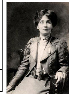
Emmeline Pankhurst was a British political activist who organised the UK suffragette movement and encouraged women into work during the war.