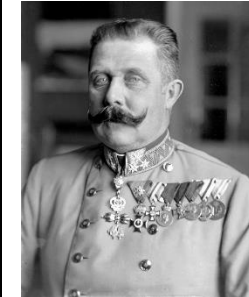
Franz Ferdinand was an Austrian archduke whose assassination was the immediate cause of World War I.